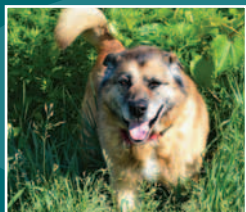
Kifli was with us 3 months and 7 days. Adopted!

The Cleveland Animal Protective League lovingly cares for thousands of homeless, injured and abused animals each year. For some, their cage at the APL, complete with a warm bed, toys, plenty of food and water, and lots of TLC, is the only "home" they have ever known. For others, it's a temporary home until they find the love of another family. For all of them, it's the reason they're getting a second chance. Our annual cage