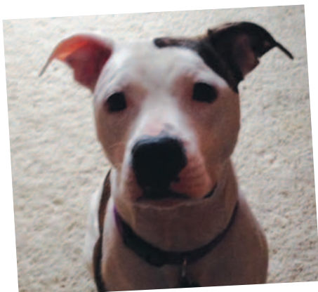
Molly sitting pretty.

That night, when I finally curled up in bed, the frustration and anger that often accompanies hard days like this one had been replaced by an overwhelming sense of gratitude – for our staff, our volunteers, and our community – our heroes, my heroes! Truly, after a long day dealing with people who didn't seem to care about animals very much, there was nothing more meaningful and important than being soundly reminded that so, so many people care very, very deeply.