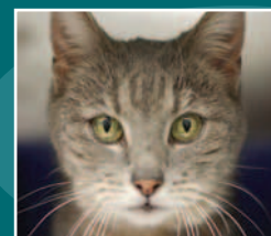
Katherine was with us 5 months and 8 days. Adopted!

We all know a cage in a shelter is not a permanent home, but with your cage sponsorship, we can make it a temporary home away from home until they have one of