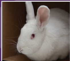
Cinnamon Bun was with us 4 months and 26 days. Adopted!

The Cleveland Animal Protective League lovingly cares for thousands of homeless, injured and abused animals each year. For some, their cage at the APL, complete with a warm bed, toys, plenty of food and water, and lots of TLC, is the only "home" they have ever known. For others, it's a temporary home until they find the love of another family. For all of them, it's the reason they're getting a second chance. Our annual cage