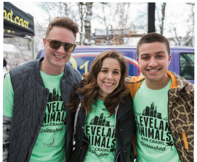
Top: Bar crawl participants show off their shirts