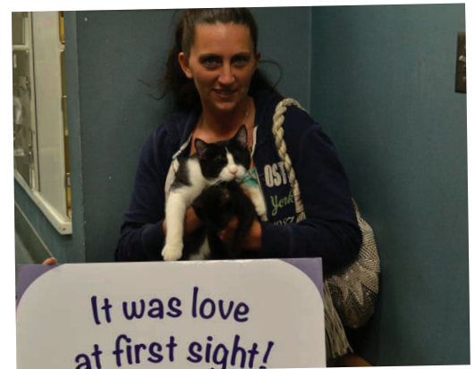
Rita and Ronin are happy to go home with their new mom!

Rita and Ronin found their fur-ever home, and helped make another home more complete. We all get by better with a little help from our friends.