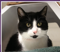
Sonya was with us 6 months and 15 days. Adopted!

sponsors bring hope and comfort to our animals while they wait for their future mom or dad to adopt them and take them home—