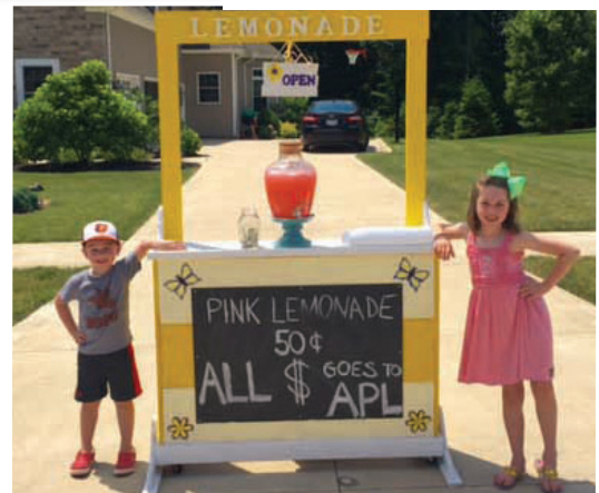
Top: Students from Gilles-Sweet Elementary School hosted a lemonade stand to raise money for the APL.

MEMBER OF GREATER CLEVELAND COMMUNITY SHARES