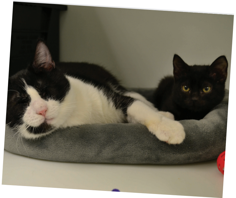
Rita and Ronin cuddle together in the APL cat adopt room.