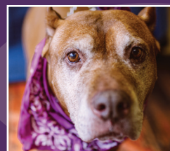
Sadie was with us 3 months and 20 days. Adopted!

We all know a cage in a shelter is not a permanent home, but with your cage sponsorship, we can make it a temporary home away from home until they have one of