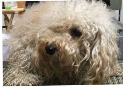
Porkchop before her grooming.