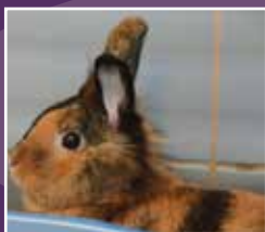
Charlotte was with us 2 months and 11 days. Adopted!

For cage sponsorship opportunities please see above.