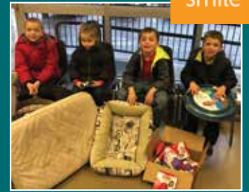
Cleveland APL Foster Family brought in beds and toys to help our animals.

We'd like to thank everyone who gave in-kind donations last holiday season. Compassionate, caring groups like MetroHealth's Surgery Center, the congregation of St. Joseph's Church, Tremont Athletic Club and many, many