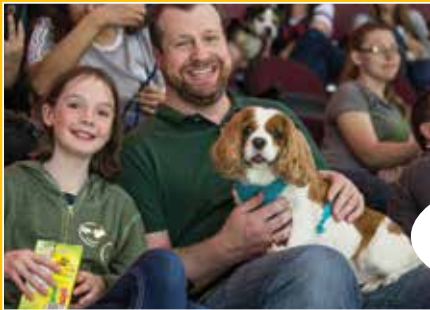
Humans and canines both enjoyed last year's Pucks and Paws game.