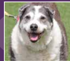
Tessa was with us 4 months and 2 days. Adopted!

We all know a cage in a shelter is not a permanent home, but with your cage sponsorship, we can make it a temporary home away from home until they have one of