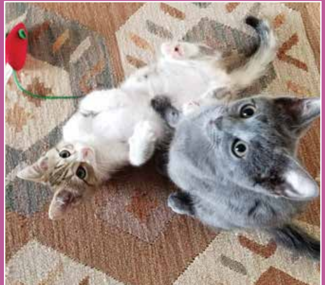
Kittens grow up and socialize in their loving foster homes.

To learn more about our Foster program, learn how to become a Foster Volunteer, and sign up for a Foster Volunteer Orientation, visit www.ClevelandAPL.org/volunteer/foster-care .