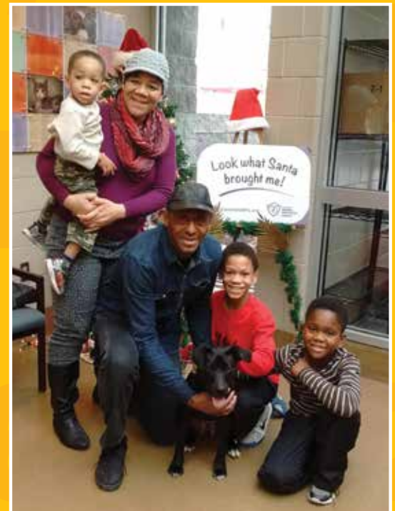
K2 is just one of 5,731 adoptions that were processed in 2017.

As hard as our team works, we would not have been able to help