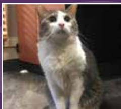
Agatha was with us 7 months and 18 days. Adopted!

The Cleveland Animal Protective League lovingly cares for thousands of homeless, injured and abused animals each year. For some, their cage at the APL, complete with a warm bed, toys, plenty of food and water, and lots of TLC, is the only "home" they have ever known. For others, it's a temporary home until they find the love of another family. For all of them, it's the reason they're getting a second chance. Our annual cage