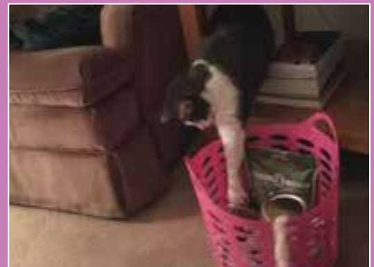
Agatha loves her very full basket of toys!