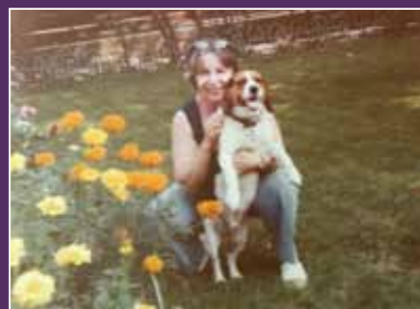
Emily and Sherlock pose for the camera in this picture from the 1970s.

Is there a loved one you would like to make a donation in honor or in memory of? Visit the Cleveland APL's website at https://www.ClevelandAPL.org any time and make a donation!