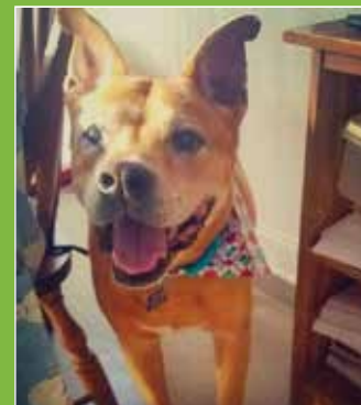
Mr. Jones is all smiles in his new home.