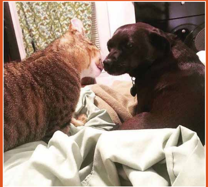
Emrys and his very patient sister, Leeloo.

bit. He was diagnosed with a slight eyelid defect (which just adds to his good looks), and a heart murmur (for which they are exploring treatment options). But the APL got him off to a good start and into a home that will deal with his shenanigans. These days this little wizard (named after the slightly goofy character on the British Merlin TV show and the magician in Mary Stewart's Merlin Trilogy) can be found trying to climb in the shower with his mom to play with the water, perching on her shoulder while she's trying to brush her teeth, teasing his long-suffering sister Leeloo (who is far too polite to give him the what-for he deserves), trying to bite everything, or trying to swallow entire pieces of string no matter how many times his mother tells him it's bad for him.