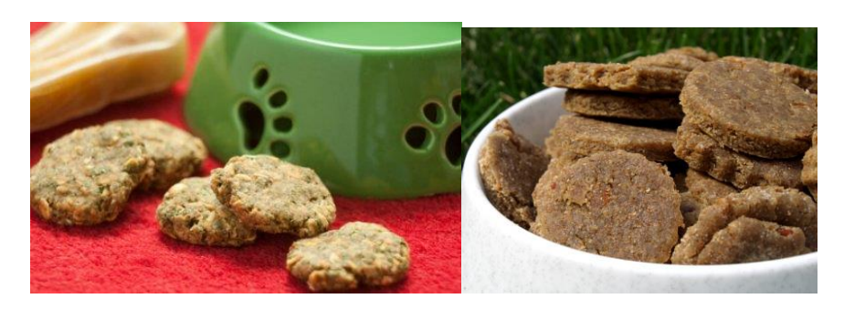
IMPORTANT! Many of these projects may require the supervision and guidance of an adult for completion.

HOMEMADE DOG TREATS: Make homemade dog treats for our dogs and bring them for our dogs. Please be sure to provide an ingredient listing and if the treats need to be refrigerated or frozen. Attached is a link for some recipe ideas. <u>http://allrecipes.com/recipes/everyday-cooking/pet-food/pet-treats/</u>