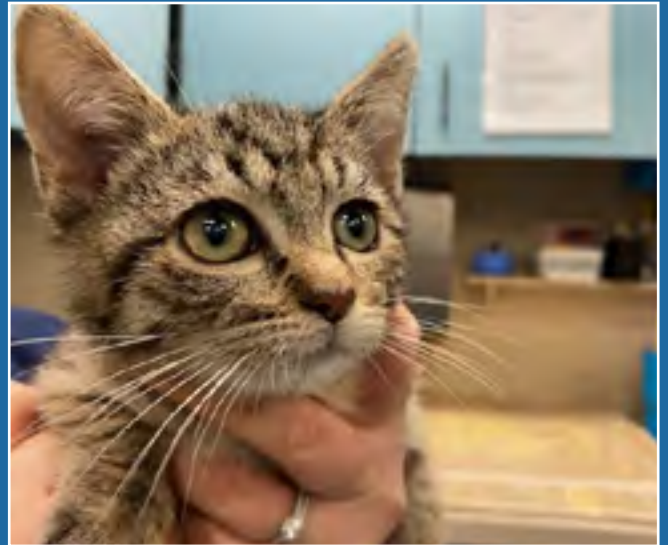
Itsy is just one of the many animals who came to the Cleveland APL in need this March.

The Cleveland APL remains committed to helping animals and pet owners in our community who have the greatest need. To that end, we announced that we were going to begin providing curbside, contact-free pet food delivery for pet owners who are self-quarantining because of age or compromised immunity, who are in isolation, or who are facing other hardships, such as financial, in the face of the COVID-19 pandemic. We asked our community for donations to support this initiative, and within five days of asking for help, we had received 830 pounds of pet food. And it's still coming in!