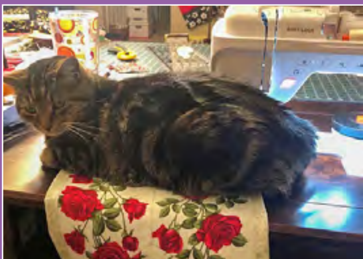
Dixie is always nearby, especially when her mom is sewing!

Anyone shying away from adopting an older cat, go for it! They can absolutely adapt to your home and become a member of the family.