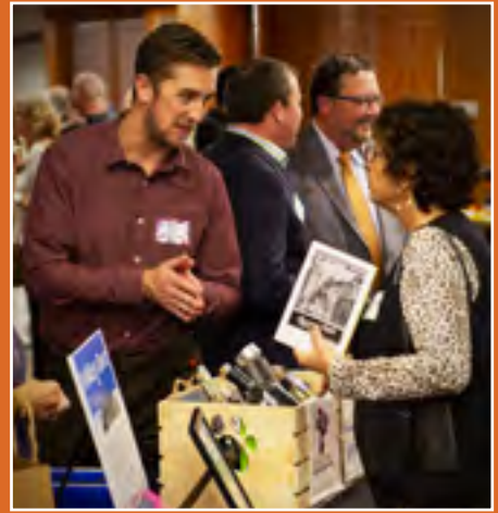
APL Volunteers and guests at last year's Fur Ball gala.

To learn more about our Second Chance Program, please visit: www.ClevelandAPL.org/donate/second-chance-program .