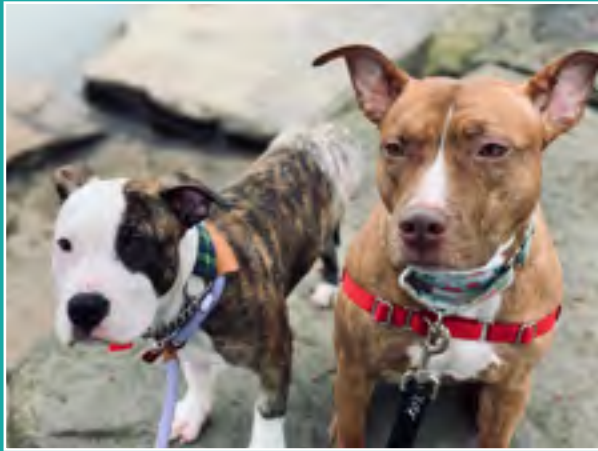
Louie, left, and Tea Cup, right, stop for a picture at the beach.