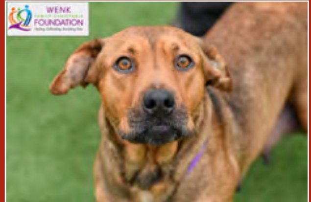
Sparkles, one of the many 29 senior animals who were adopted thanks to the grant from the Wenk Family Charitable Foundation.

Charitable Foundation's generous grant, a total of 14 senior dogs and 15 senior cats found homes in February and March 2020.