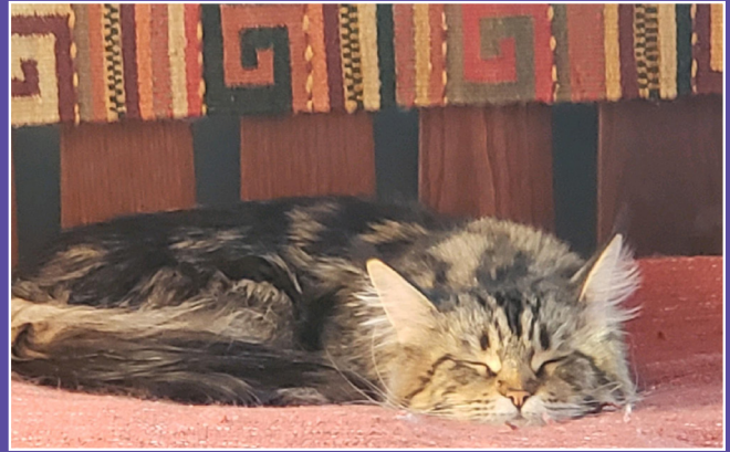
Mani taking a nap in a patch of sunlight.