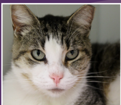
Debra Morgan was with us 3 months and 23 days. Adopted!

The Cleveland Animal Protective League lovingly cares for thousands of homeless, injured and abused animals each year. For some, their cage at the APL, complete with a warm bed, toys, plenty of food and water, and lots of TLC, is the only "home" they have ever known. For others, it's a temporary home until they find the love of another family. For all of them, it's the reason they're getting a second chance. Our annual cage sponsors bring hope and comfort to our animals while they wait for their future mom or dad to adopt them and take them home—permanently. We ask that