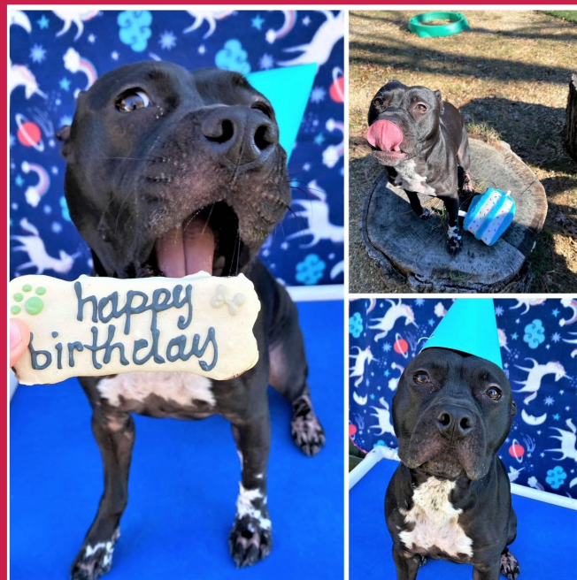
Phoenix celebrates her second birthday in style, now fully grown and covered in fur!