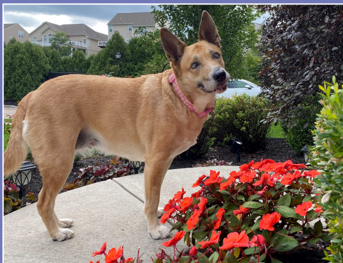
Dooda lives her life like a regular dog and even takes time to sniff a few flowers!