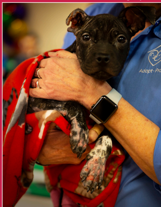
Phoenix when she was at the Cleveland APL, even after a month of care still had visible scars and fur loss.

Phoenix was able to find her happily ever after in 2019, but there was still work to be done to get justice for this