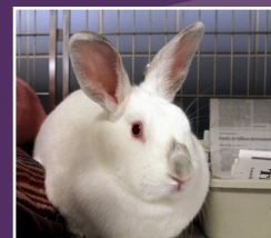
Nonap was with us 2 months and 16 days. Adopted!

For cage sponsorship opportunities please see above.