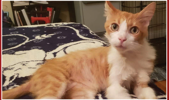
Mochi when he first made his way into his loving home.

Others go temporarily to a foster home, where we get medicine, food, and love until we feel well enough to find a forever home.