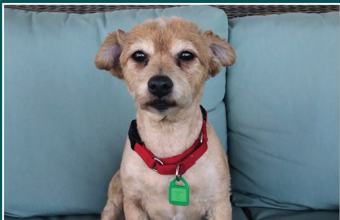
Pepper enjoying the sweet life in his foster home.