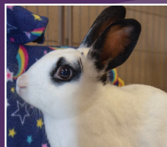
Peter Pan was with us 3 months and 10 days. Adopted!