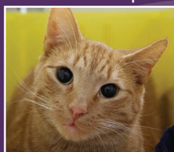
Van de Kamp was with us 11 months and 21 days. Adopted!

For cage sponsorship opportunities please see above.