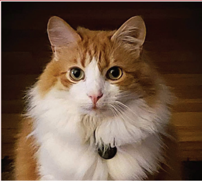
Mochi now, all grown up and a complete fluff ball!

He saw animals coming and going, and, late at night, he asked the cat next door what that was all about. Well, the cat explained, some of us leave here to go to a permanent home.