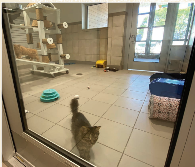
A few of the cats already enjoying the inside catios!

The new adoption lobby has a number of private consulting "cubbies" so that adopters can sit down and receive individualized care when finding their new family members. There's a designated greeter desk at the front so that new visitors can easily find their way around this amazing new shelter. Those windows in the ceiling have a fancy new film that reduces the amount of heat that comes through and makes the space more comfortable for people and animals. It also still lets the sunshine through, which is great, because sunshine makes me happy! And even more exciting is that there will soon be two adoption stations in the cat adoption room—allowing cat adopters to complete their entire adoption right where they met their new best fur-riends.