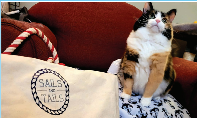
Koi, an APL foster cat, got to enjoy Fur Ball from home with her foster family!