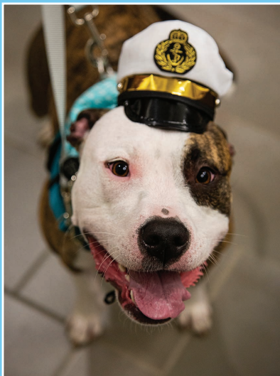
Fur Ball's VIP, Crowler, donned his nautical gear in honor of the event.

Whether virtual or in-person, save the date and join us again next year for Fur Ball 2022—Saturday, November 5.