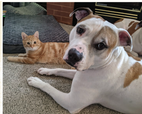
Spokesdog Indiana Bones with his feline sister, Luci.

Hey! Do you know what a catio is? I didn't, but let me tell you, it's amazing! The new catios are two group living spaces for cats at the front of the building that have big windows and access to safe, caged-in outdoor enclosures. That means my feline friends can sit outside and enjoy fresh air when the weather is nice. I love when a fresh breeze blows through a window, and I'm happy that the cats at the Cleveland APL will now get to enjoy it, too. They will even be able to watch the butterflies and birds that come to hang out on the new plantings. It's like they get their own TV!