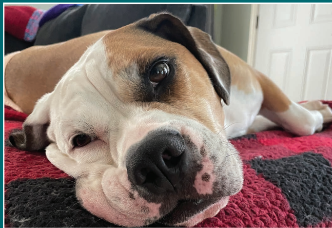
For Cain, happiness is always just one snuggle away!