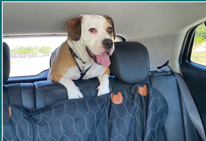
Cain is all smiles while doing his favorite things, like going on car rides!