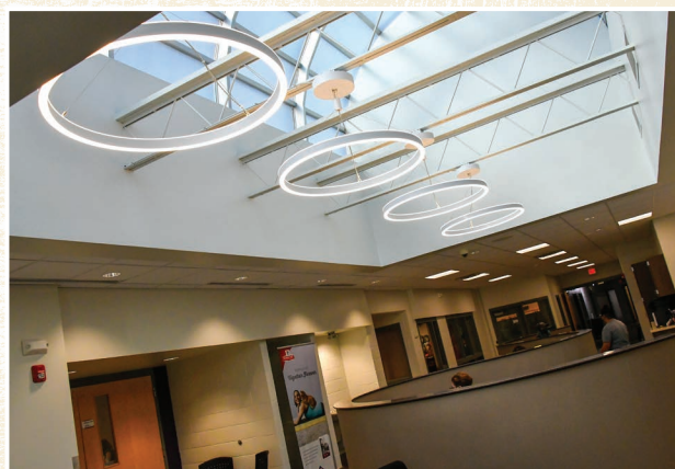
A view of the updated Adoptions area looking toward the updated windows and lights.

The APL team is on the home stretch to raise the remaining funds to complete the Unleash the Dream Capital Campaign. Please consider making a donation that will make a difference in the lives of animals at the Cleveland APL for years to come! Visit UnleashtheDream.org to learn more about the Capital Campaign and donate today!