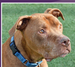
Walker was with us 6 months and 24 days. Adopted!

The Cleveland Animal Protective League lovingly cares for thousands of homeless, injured and abused animals each year. For some, their cage at the APL, complete with a warm bed, toys, plenty of food and water, and lots of TLC, is the only "home" they have ever known. For others, it's a temporary home until they find the love of another family. For all of them, it's the reason they're getting a second chance. Our annual cage sponsors bring hope and comfort to our animals while they wait for their future mom or dad to adopt them and take them