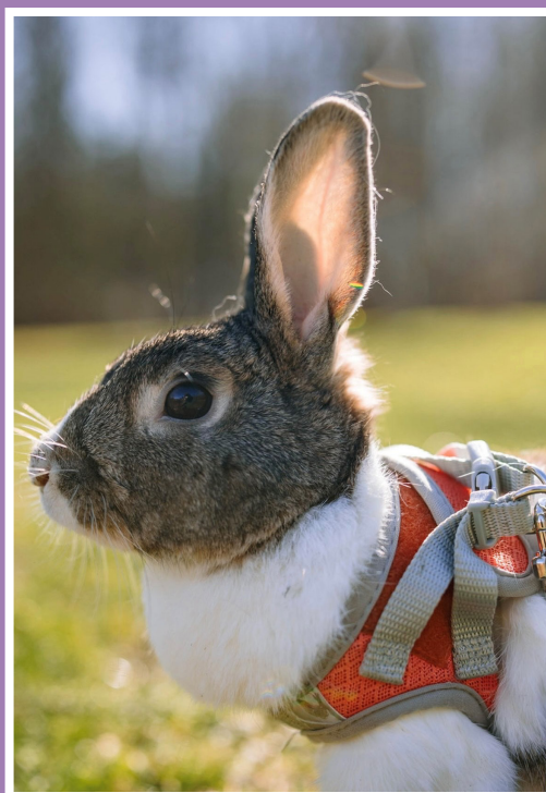
Once Lt. Dan settled in to his new home, he was fitted with a rabbit harness to safely explore outdoors!