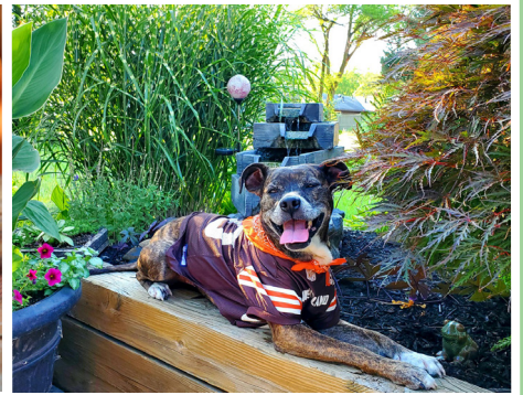
Photos of some of the animals that were entered into the 2023 Pet Calendar Contest by their families.