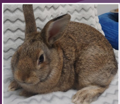
Vanellope was with us 4 months and 1 day. Adopted!

For cage sponsorship opportunities please see above.