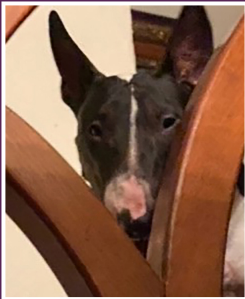
Ava loves peering through the arches of the railings in her new home.

Though the road to her forever home was not a yellow brick one, Dorothy—Ava—certainly knows that there's no place like her new home.