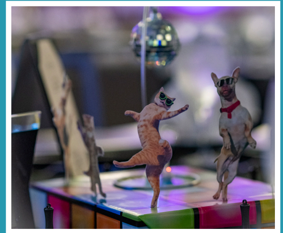
Centerpiece from 2022 Fur Ball

There are many opportunities to participate by either purchasing tickets, becoming a corporate sponsor, or donating an item or service for our live or silent auctions. To learn more about the event and the ways you can get involved, please call 216-377-1628.