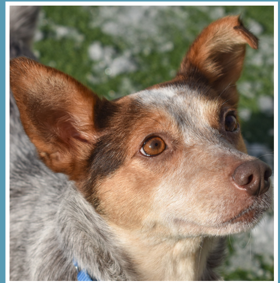
Juno, a dog the Cleveland APL was able to help thanks to your donations! Adopted 2023.