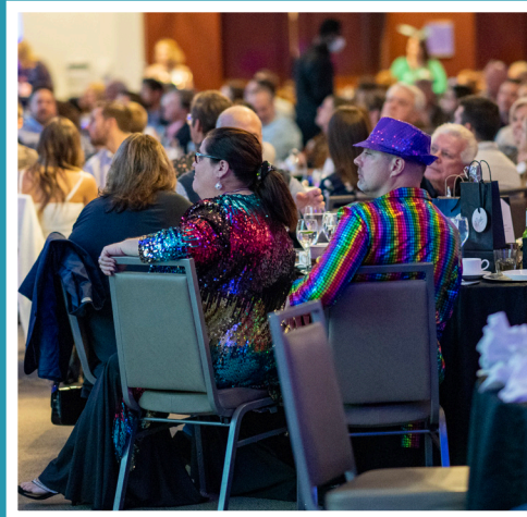
Attendees enjoyed dinner, video presentations, and our event program in the Grand Ballroom.