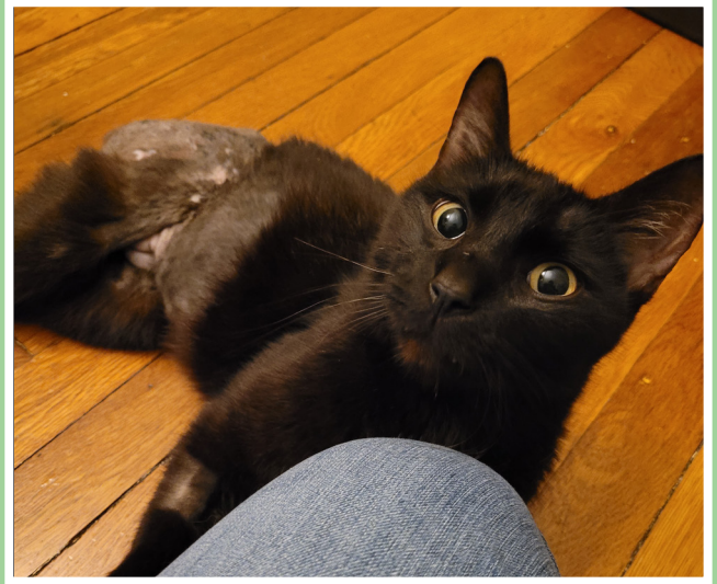
Prince has always been an affectionate cat, even as his wounds healed.

Since this little Prince had been through so much, his caregivers at the APL decided that he would benefit from