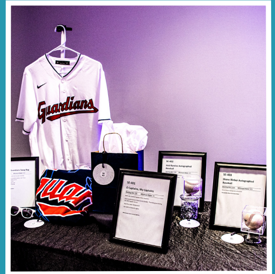
Cleveland Guardians auction items from our 2022 Fur Ball.