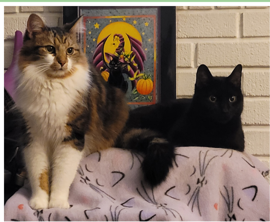
Prince and new brother Gizmo love keeping an eye on their home together.