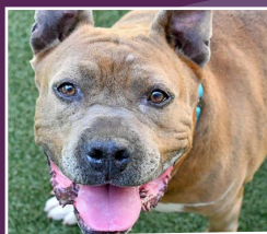
Tony was with us 5 months and 8 days. Adopted!

The Cleveland Animal Protective League lovingly cares for thousands of homeless, injured, and abused animals each year. For some, their cage at the APL, complete with a warm bed, toys, plenty of food and water, and lots of TLC, is the only "home" they have ever known. For others, it's a temporary home until they find the love of another family. For all of them, it's the reason they're getting a second chance. Our annual cage sponsors bring hope and comfort to our animals while they wait for their future mom or dad to adopt them and take them