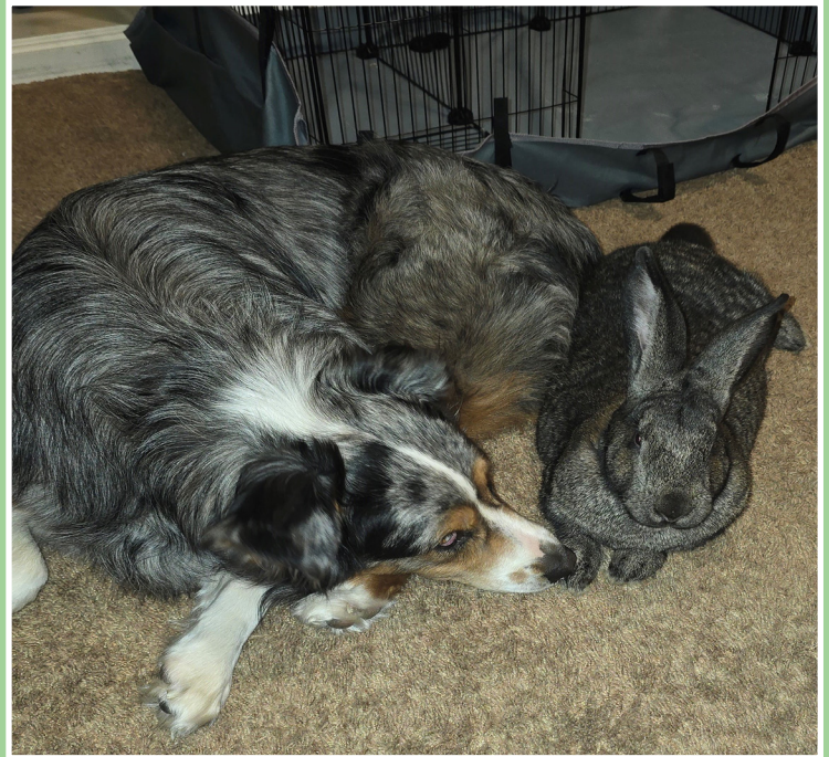
Extra Butter snuggles up with her new best friend, Rocky.