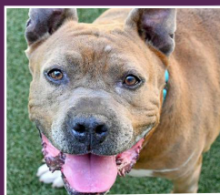
Tony was with us 5 months and 8 days. Adopted!

The Cleveland Animal Protective League lovingly cares for thousands of homeless, injured, and abused animals each year. For some, their cage at the APL, complete with a warm bed, toys, plenty of food and water, and lots of TLC, is the only "home" they have ever known. For others, it's a temporary home until they find the love of another family. For all of them, it's the reason they're getting a second chance. Our annual cage sponsors bring hope and comfort to our animals while they wait for their future mom or dad to adopt them and take them