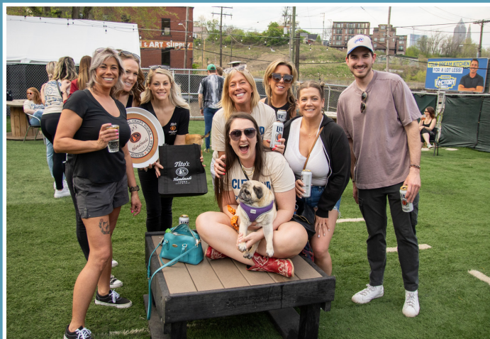
Tito’s Handmade Vodka sponsored this year’s Bar Crawl and came out to Taps and Tails to enjoy the event.

Over 1,200 shirts were purchased to attend the crawl, and Crawlers made stops at some of Cleveland’s amazing animal-themed bars like The Flying Monkey Pub, Taps & Tails, Thirsty Parrot, Wild Eagle Saloon, Harry Buffalo East 4th, and Velvet Dog.