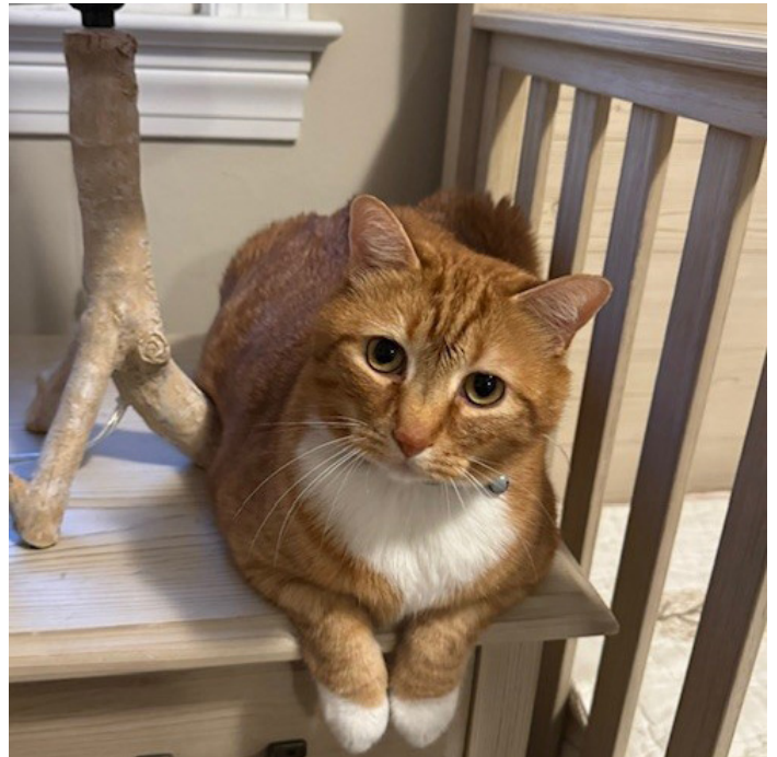
Van Gogh making himself at home with his new family.