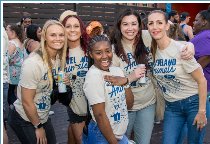
Bar Crawl participants visited Velvet Dog’s rooftop during the crawl.

Over $20,000 was raised by the 9th Annual Bar Crawl for the Cleveland APL, bringing the grand total to over $190,000 since the start of the event in 2014! Thank you to everyone who participated!