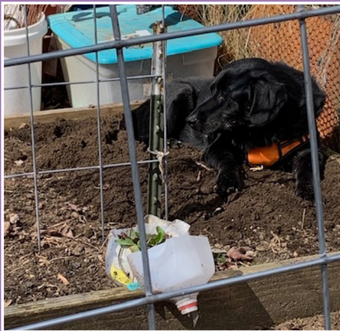
Hoppy's favorite spot in his family's vegetable garden.

Hoppy takes his role as the guardian of the family's 7 ½-acre property seriously. In particular, he loves laying guard in front of the vegetable garden, protecting it from squirrel invaders. He also showed a gentle curiosity toward the family's chickens, ensuring their safety without any hint of aggression.