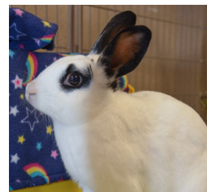
Peter Pan was with us 3 months and 10 days. Adopted!