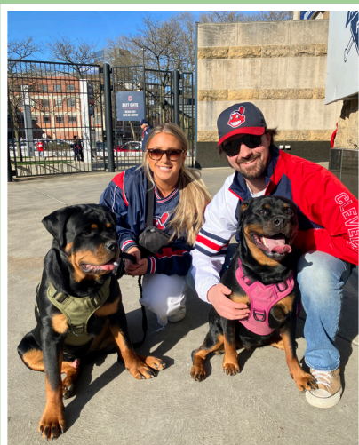
Guardians doggy fans and their humans enjoying the game!

The Cleveland APL is so grateful for the Cleveland Guardians continued support of our mission. The Cleveland Guardians players, staff, and their families recently visited the APL to volunteer and tour the facility. They spent a few hours of their morning building dog beds; crafting blankets, cat toys, and dog enrichment items for the APL's animals; and even enjoyed getting to meet adoptable puppies and kittens.