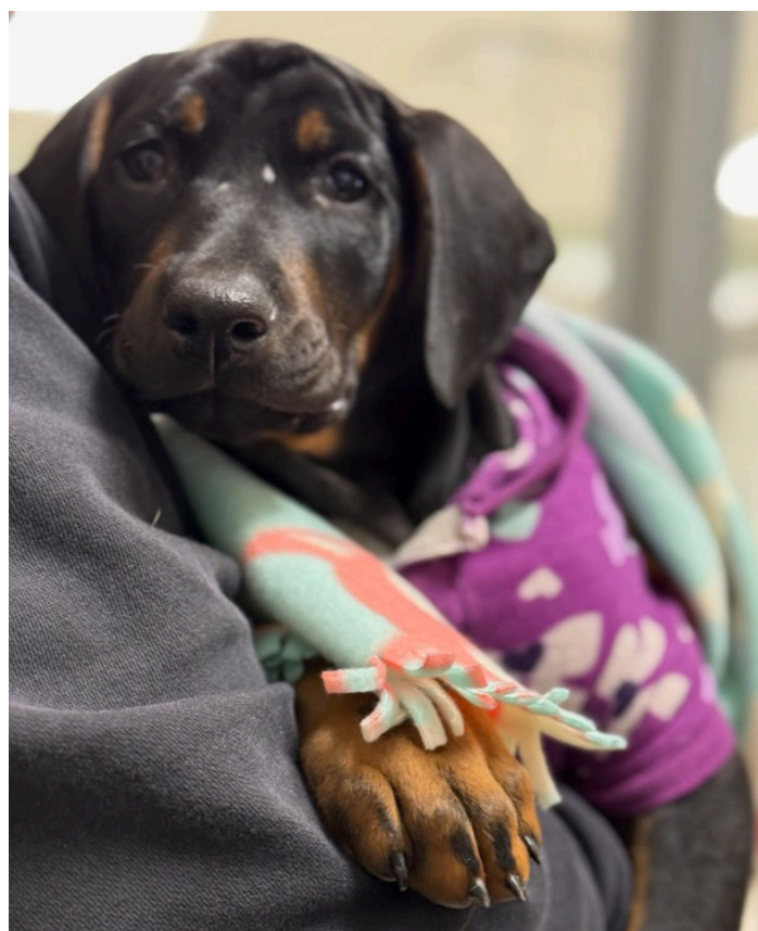
Sweet Luna arrived at the APL with her four littermates