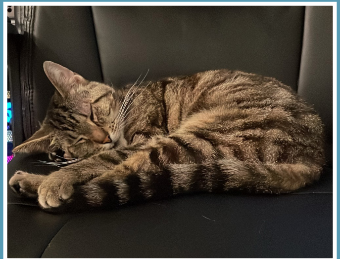
Mandy is a true lap cat and is always eager for long snuggles