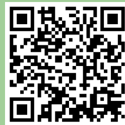
Scan QR Code to Give