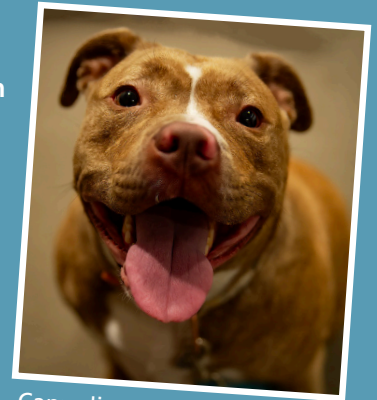
Cannoli, our VIP

In-person attendees had a great time at the many food stations as well as bidding on fabulous items in our live and silent auctions, while virtual guests were able to bid on auction items and enjoy our Fur Ball program from the comfort of their own home. All guests also learned about some very special animals whose lives were saved because of the medical care and expertise the Second Chance Program allows us to provide.