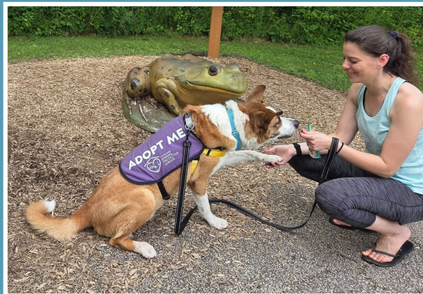
Trevor takes a hike with one of our amazing community volunteers. He is now adopted!

And we know our dogs are grateful, too! For more information on Dog's Day Out and how to get involved, visit https://clevelandapl.org/dogs-day-out .