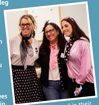
Guests were dressed in their poodle skirts and leather jackets!