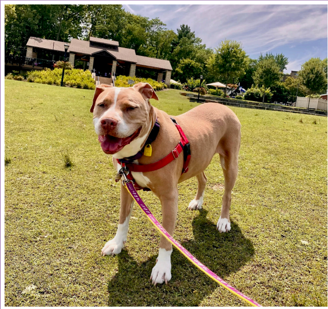
Fran enjoys her new backyard.