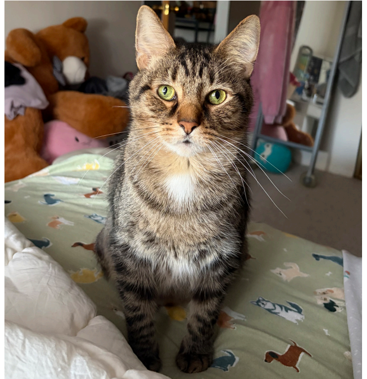
Archie is a handsome, happy kitty living the best life!