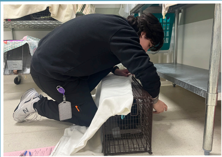
Cats who go through TNR are all vaccinated, spayed or neutered, and ear-tipped before being returned.

We would like to thank the following funders and donors for supporting TNR by subsidizing part of the APL's cost and keeping the copay to program participants very low: Cleveland Animal Care & Control (Cleveland cats only), Kenneth A. Scott Charitable Trust, a Keybank Trust, the Bernice Barbour Foundation, the Ohio Pet Fund, the Ware Foundation, and the Molly Zangerle Suburban Spay-It-Forward Program.